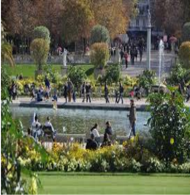
Le Jardin du Luxembourg